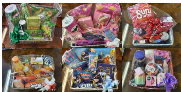
Examples from last year's raffle

Last year donations included sweets, packets of biscuits, snacks, drinks, shampoo, bubble bath, candles and flannels in various colours. The raffle will be held at the Christmas Fair on 1 st December after school.