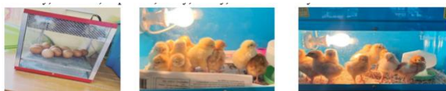
2022 Hatching Chicks

So far this term, FOSS has funded the reptile visit, the robot mice that the children have been learning to program with, and the hatching eggs which arrived at the school last week. We wouldn't be able to provide this enrichment activities without your help, so thanks!