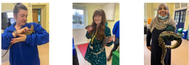
Reptile Visit, February 2023