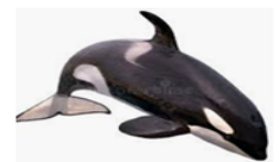
Orca I eat seals and squid.

Creative Challenge: Make a snail or a whale out of things you have at home. This could be construction toys like lego or junk model out of recycling.