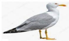
Sea Gull I eat crabs and small fish.