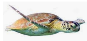
Sea Turtle I eat jelly fish and sea grass.